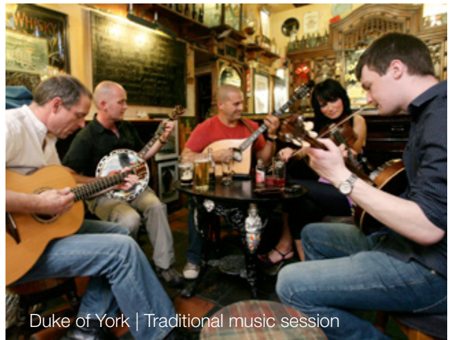
Duke of York | Traditional music session

With many thanks to Tourism Northern Ireland, Belfast and Visit Belfast for all their support